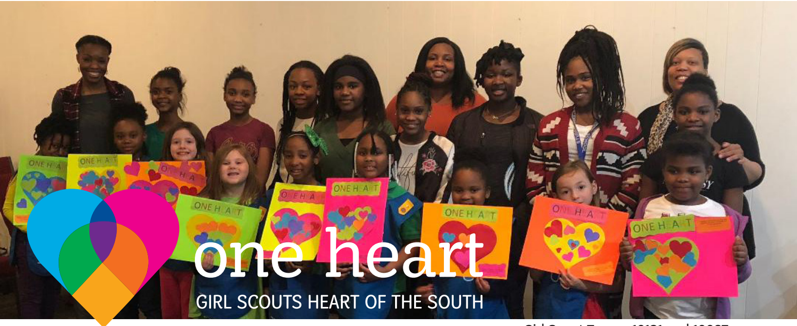
Girl Scout Troops 10121 and 10087

"showing kindness towards those who are different and embracing our imperfections as proof of our humanness is the remedy for fear."